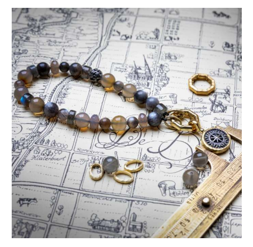
At Compass-Jewelry, the phrase "Unique Jewelry Designs" goes beyond mere ornamentation; it embodies a philosophy. The meticulous selection of gemstones

In the enchanting world of jewelry, each piece tells a story, and at Compass-Jewelry, the narrative is woven with the language of gemstones. <u>Unique jewelry designs</u> take center stage, inviting you into a realm where every piece is an expression of artistry and individuality.